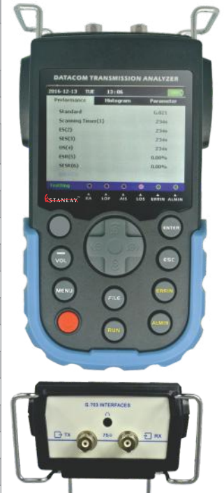
E1 BER TESTER